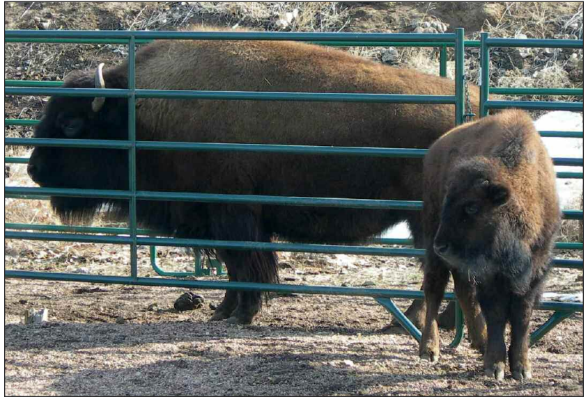
Ralphies IV and V together in November 2007

Ralphie III , donated by the C-Club, was pressed into action earlier than anticipated, as she had been in training for the 1988 season. Originally named "Tequila," she made her debut on Nov. 7, 1987, when the Buffs beat Missouri, 27-10. After over 10 years of service, she passed away in January 1998, at the age of 13.